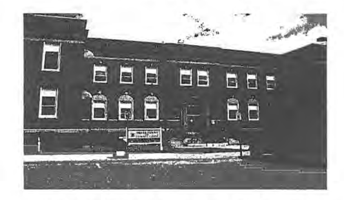
Bernadette Building (#48) Minimum and Work Release Unit

Gloris McDonald Building (#47): Awaiting Trial/Medium Security Unit